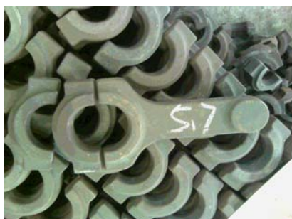
FORGED RODS BLANK